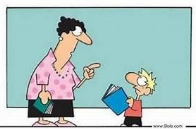
It's called reading . It's how people install new software into their brains.