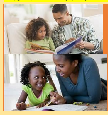
YOUR CHILD- IT IS THE BEST WAY TO ENGENDER A LOVE OF READING!